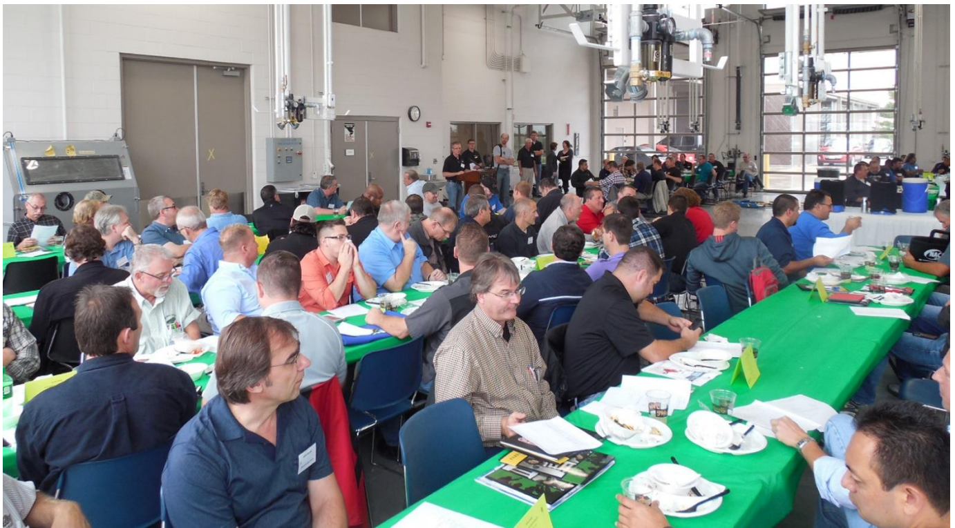
Gathering For Lunch – Always great food at ICAIA!

ICAIA thanks everyone at Parkland College for hosting a great conference!